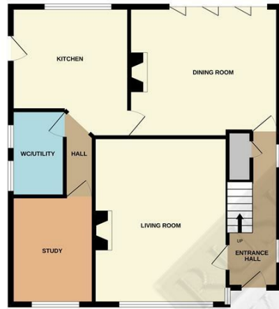
GROUND FLOOR 790 sq.ft. (73.4 sq.m.) approx.